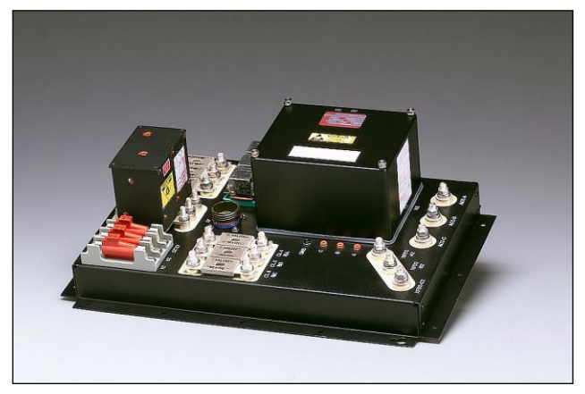
Figure 4. Custom power distribution panels provide an engineered solution for power distribution management.

specific power panels, an example of one designed and built by TE is shown in Figure 4, as a plug-and-play solution to power management and distribution. These panels contain not only contactors or relays, but also the control electronics to provide advanced monitoring and control capabilities.