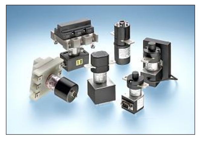
Figure 2. Even as contactors grow more intelligent in monitoring capabilities, they continue to evolve to meet SWaP goals.

The adoption of 270 VDC and 540 VDC, first into military and now commercial aviation, has forced dramatic design changes in power contactors. Existing 28 VDC designs are not suited for high-voltage switching because of their inability to generate adequate arc voltage for interruption—at least in a reasonable package size. To overcome these physical limitations, the contactor design must rely on such methods as arc splitting plates, runners, blow-out magnets and better internal switching atmospheres. A 540 VDC system is often split into positive and negative channels that must now be controlled either with 2x contactors or new 2-pole switching designs.