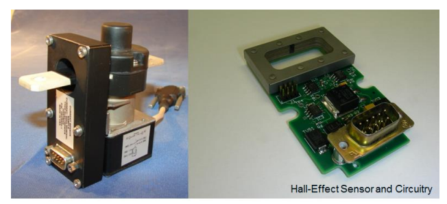
Figure 3. Hall-effect sensors are flexible and accurate.

Hall-effect sensors are another common method of measuring the magnetic field created by the current. Hall-effect elements change a voltage output level based upon exposure to a magnetic field. This field is most commonly expressed across the Hall-effect sensor using a flux ring or collector surrounding the contactor's bus bar or output feeder. Not only are modern Hall-effect sensors programmable for output voltage and linearity, they also can allow bidirectional current sensing and AC sensing. TE advanced its Hall-effect current sensor with the addition of the math function circuitry to have to emulate the l<sup>2</sup>T trip function of a thermal circuit breaker. Using the Hall-effect technology the device trip times are not affected by ambient temperatures like conventional thermal breakers. This device has an optional reverse current trip function that gives additional protection.